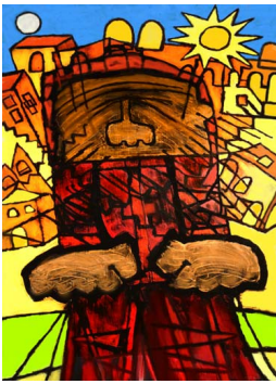
Jonah was displeased... Jonah 4:1