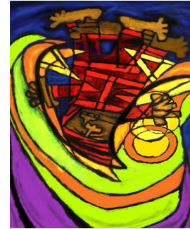
Jonah meets God's special fish... Jonah 1:17