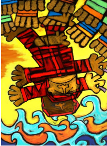
Jonah tossed into the sea... Jonah 1:15

There it is again – that death wish. He was upset because his predictions weren't coming true. It was about pride!