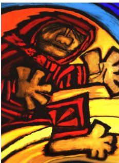
Jonah takes off for Nineveh... Jonah 3:2

After Jonah had gone through all that he had, he was confronted with the same instructions as before, with one slight change. In the beginning God asked Jonah to cry out "against" ( aleyha ) Nineveh. Now Jonah was asked to cry out "to" ( eleyha ) Nineveh. A subtle change. Aleyha means "against" with a downward intimation. Eleyha means "towards." The significance of this slight change in wording is not clear. Perhaps some change had occurred in Nineveh that warranted a slightly different message than was appropriate before Jonah set out on his escape.