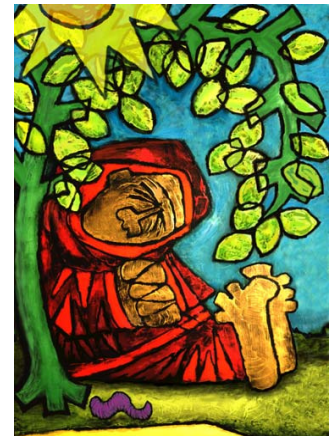
Jonah cooling off... Jonah 4:6