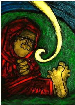
And God spoke to Jonah... Jonah 1:2

Jonah had a serious pride problem. It was always about his reputation. Apparently, he was something of a national hero, having successfully predicted that Jeroboam would restore Israel's borders. 1