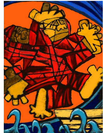
Jonah flees from God... Jonah 1:3

Jonah sleeps during a wild storm... Jonah 1:4-5