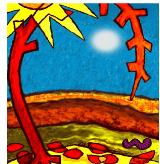
Mission accomplished, the worm goes home...

The Ninevites were a terrible, cruel and idolatrous people. Yet, when they repented, God was more ready to forgive them than His human prophet was. Though Jonah was already as good as dead and buried for his sin, when he repented God forgave him, rescued him and returned him to ministry.