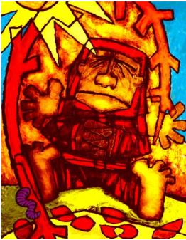
Jonah, hot and bothered... Jonah 4:7-11