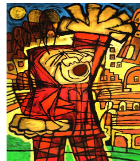
Jonah proclaimed God's message... Jonah 3:4